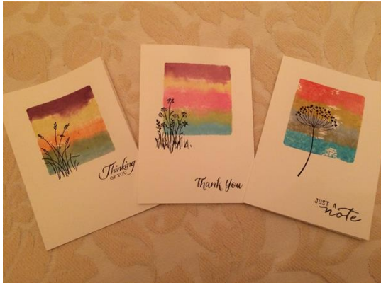
Wetlands is card to the left.

A super easy, super quick technique. You get a different, yet equally lovely, result each time you use it. Choose your colours (I normally use 5) and get your Markers to the ready. Lost Lagoon, Mossy Meadow, Tangelo Twist, Hello Honey, Blackberry Bliss.