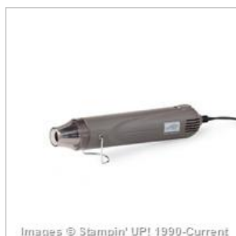
Heat Tool (Uk)