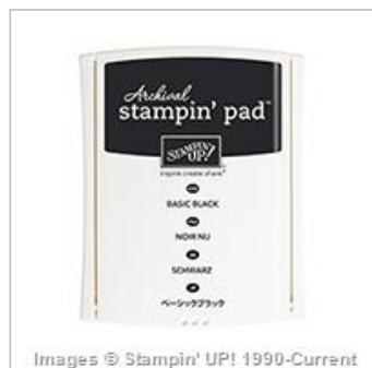
Basic Black Archival Stampin' Pad